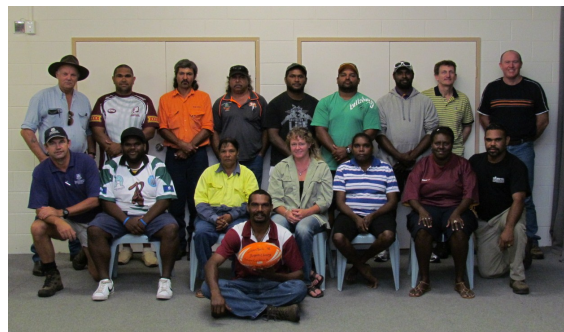
Animal Management Course, Cairns October 2011